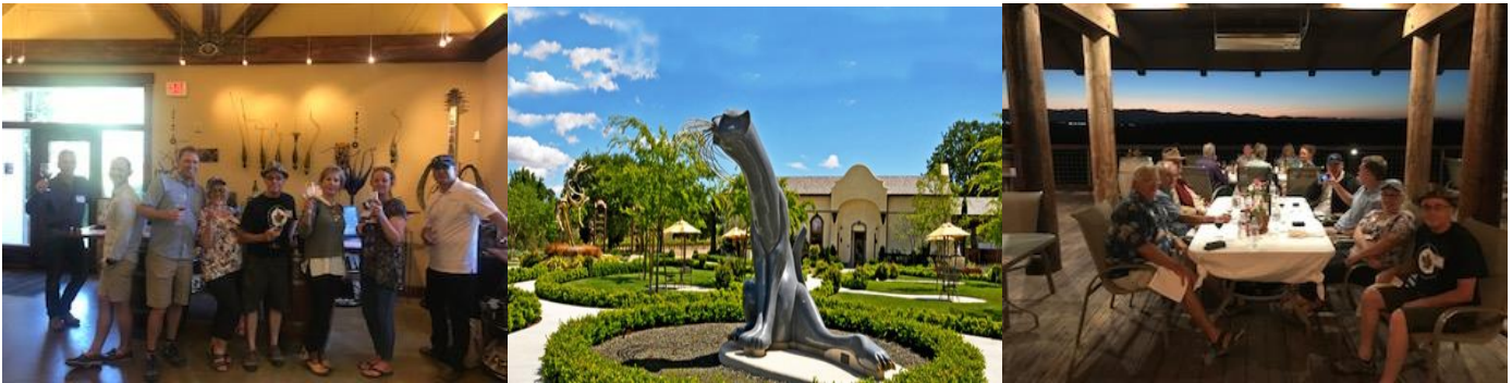
Enjoying wine and Sculpture at "Sculptura"