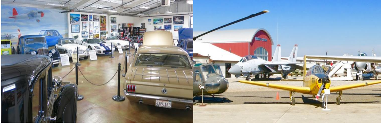
Estrella Warbird and Race Car Museum