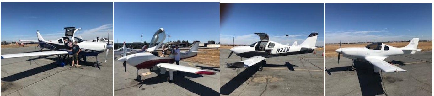
Some of the "Eye Candy"