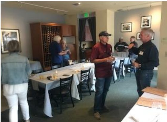
Arrival Reception at the Park Street Grill

Everyone expressed their enjoyment of the short but intensive program at the stop-over in Paso. A special thanks is due to Lancair International which organized the overall rally , and other organizations including the Airport Manager & Commission, the EAA465 Chapter which hosted the Paso stopover, FBO ACI Jet which provided a fuel discount & paid for several meals, Ford V8 Club members who provided transport to wineries, & Genuine Aircraft Hardware which provided financial support.