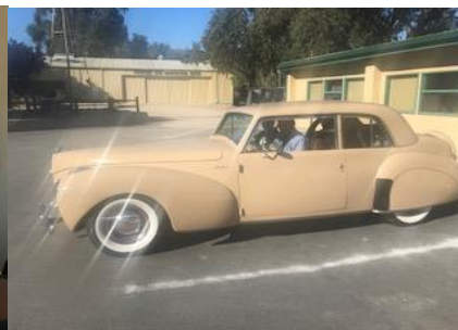
One method of transport to wineries