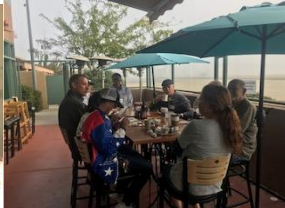
Breakfast at the "One Niner" Airport Café