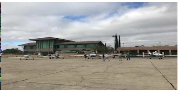
for Redmond Oregon